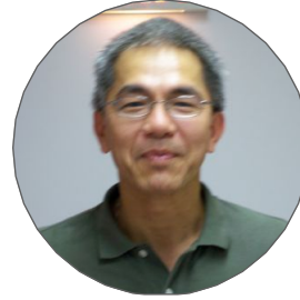
Chung Grade 11/12